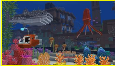
Coding with Minecraft