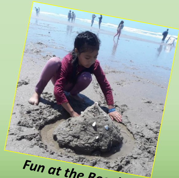
Fun at the Beach!