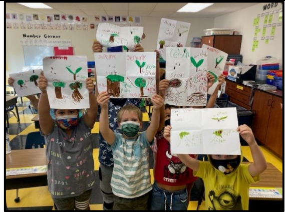
Students showing off their art work as they learned about plants.