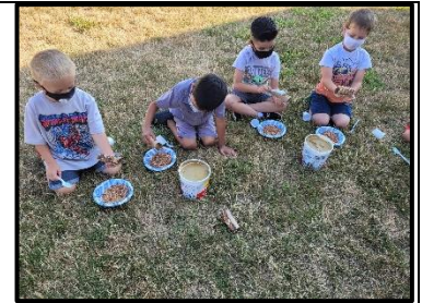
Kindergarten students making bird feeders.