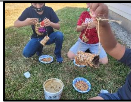
2 nd -Grade students making bird feeders for our local feathered friends.