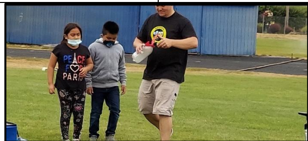
Newcomer class students helping retrieve and launch rockets at the football field.