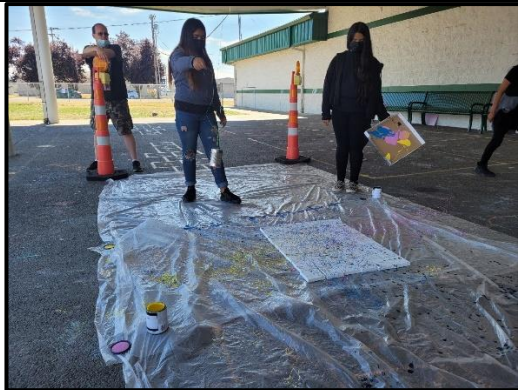
5 th -graders using a swinging paint can to create some fantastic modern art!