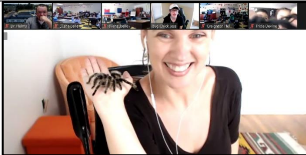
The Bug Chicks provide a virtual assembly to teach our students about all things buggy!

We are half-way done with GSD Summer School 2021 and so far, things have been awesome! Students continue to learn in the classroom and have opportunities to take part in some great “camp-like” activities. This week, many students had the opportunity to “Zoom” with the Bug Chicks ( https://thebugchicks.com/ ) and learn about all things creepy, crawly, and awesome! Students also accompanied Dr. Helms to St. Louis Ponds to conduct ecological studies and native plants. They also built bird feeders, launched rockets, created some amazing art, and more! Weeks 1 and 2 have been great, and weeks 3 and 4 will be even better!