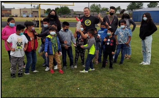
Launching bottle rockets with our Newcomers class.