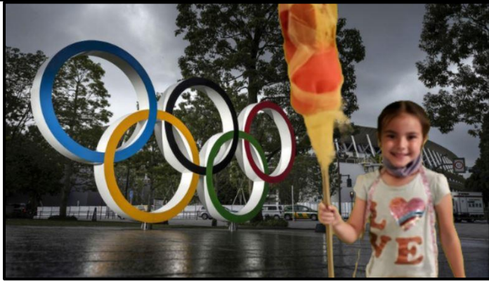
A Gervais Summer School Olympian!