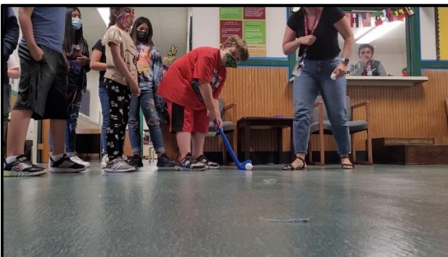
Students playing an Office Olympics Golf Game!