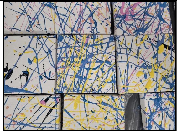
The individual canvases are all numbered, 1-48, and will be reassembled in order and displayed outside the office later this summer.