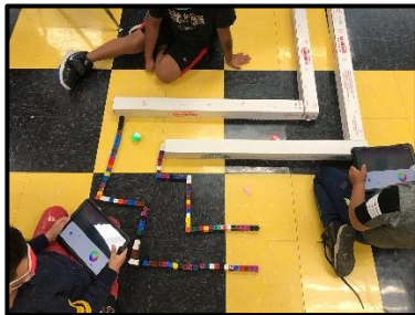
Students using tablets to code and wirelessly control their Sphero robots.